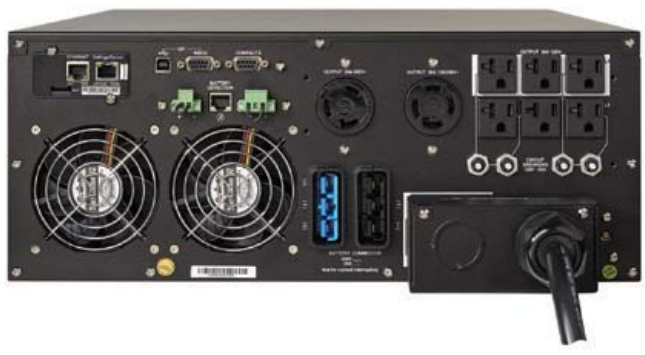
Split-phase models incorporate flexible receptacle configurations that natively offer both 208 and 120 volt. Rear panel of 9PX 6K split-phase shown above.