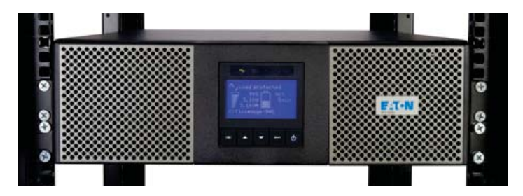
Each 9PX includes a 4-post rail kit.

The 9PX has the versatility to meet the demands of a wide array of IT applications.