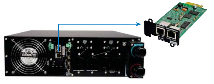
The bundled Network Card-MS allows the 9PX to connect to an Ethernet network and the Internet, supporting real-time monitoring and control of UPSs across the network via a standard Web browser, SNMP-compliant network management system or power management software.