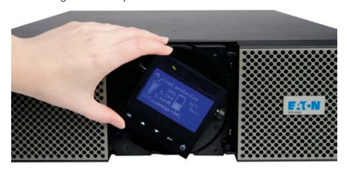
The 9PX displays key data such as its up to 93 percent efficiency rating, alarm history, runtime remaining, load percentage and more in a graphical format.

With an LCD interface that tilts 45 degrees for optimal viewing, rotates to match rack and tower installations, and provides clear information on UPS status and measurements, the 9PX makes local management easy.